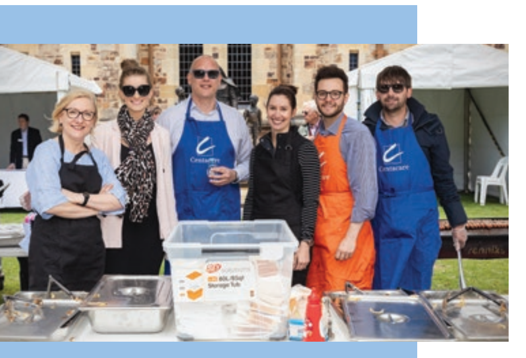
CATHOLIC CHARITIES, DIOCESAN AND CENTACARE STAFF ON BARBECUE DUTIES AT THE EXPO

In 2019 young fundraisers did us proud with schools again coming up with lots of ideas to raise money for Catholic Charities through the me4u campaign. Students were provided with badges, stickers, leaflets, posters and online resources to support their fundraising efforts which were shared on the me4u website and Facebook page.